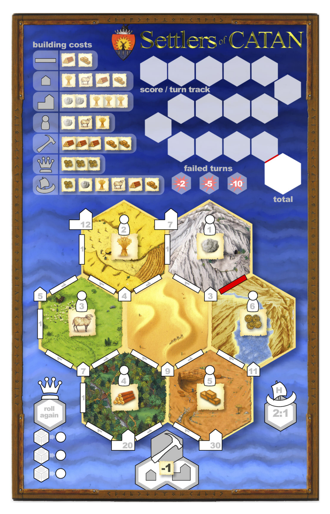
Instructions: Print this page and laminate it using a sheet of self-adhesive laminate. Trim. Now you can use dry-erase markers to play, wipes clean when you're finished.