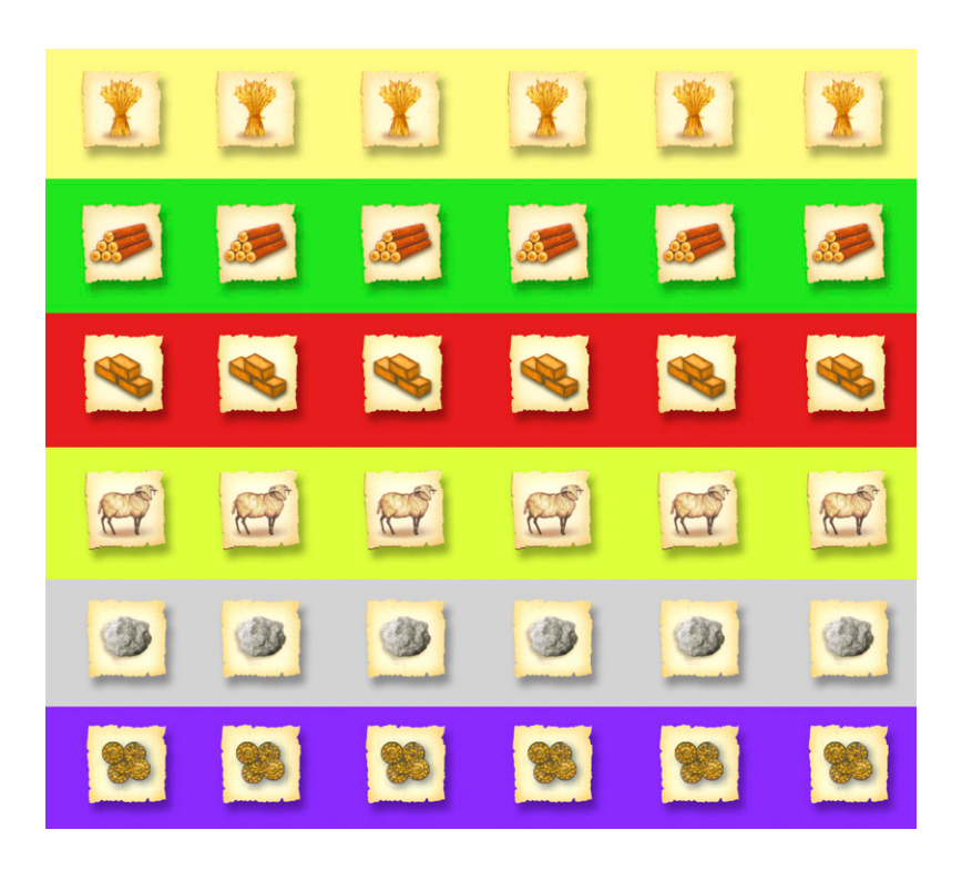
Instructions: Print on full sheet adhesive label paper. Cut and paste onto blank six-sided die. Use to make extra die for each player, or to replace lost dice.